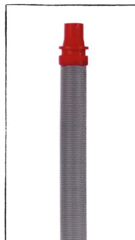
Red 200 Mesh Product Filter