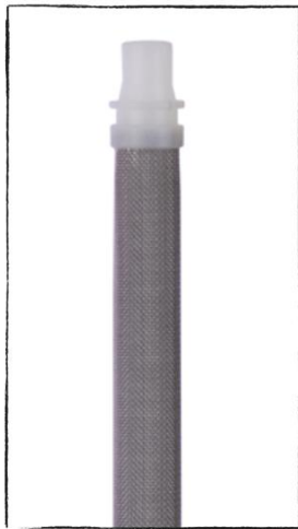
White 50 Mesh Product Filter