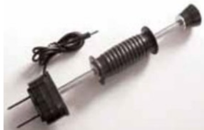
Light Duty Hammer Electrode