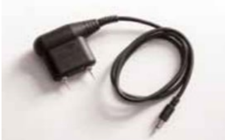
Heavy Duty Moisture Probe