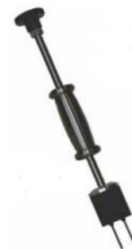
Heavy Duty Hammer Electrode

Hammer Electrode readings are more meaningful and less destructive than an Oven Drying Test. The oven gives an Average moisture content. The Hammer Electrode enables the user to measure the Highest moisture content (to 30mm) which is the requirement of most users.