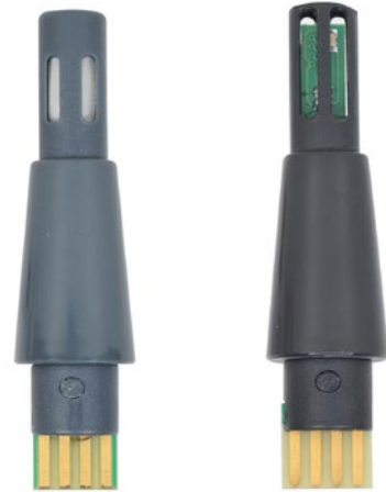
Quikstick ST POL78751, standard with all MMS2 kits and with the same performance as the standard Quikstick. A Quikstick ST can remain connected to the MMS2 while using the pins.