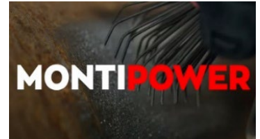
Welcome to the world of MONTIPOWER