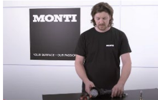
How to use the Bristle Blaster