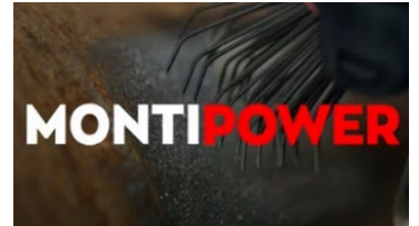
Welcome to the world of MONTIPOWER