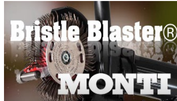
MONTI Bristle Blaster® - Blasting without grit! Applications