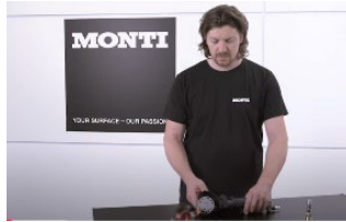
How to use the Bristle Blaster