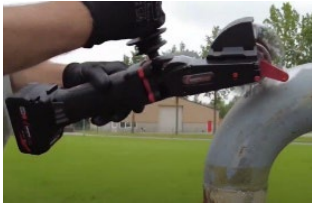
How to Remove Rust and Corrosion at Heights?

Click on the images below to view the videos