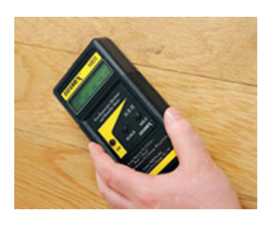
In Moisture Measurement Mode