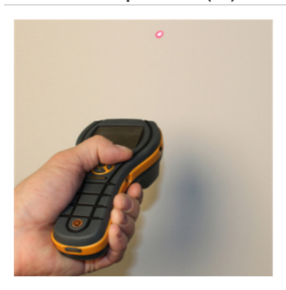
Surface Temperature (IR)

Checks surface temperature, utilizing laser pointer, calculates proximity to dewpoint