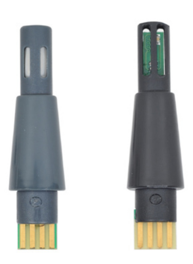
Hygrostick part number POL4750, for high moisture applications.