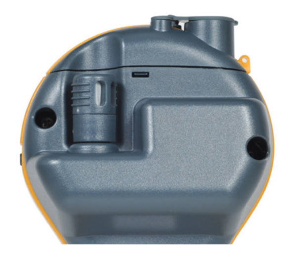
Quikstick ST POL78751, standard with all MMS2 kits and with the same performance as the standard Quikstick. A Quikstick ST can remain connected to the MMS2 while using the pins.

Readings from multiple Hygrosticks can be taken and recorded with ease. Humidity readings can be taken with the use of humidity sleeves or humidity box. Hygrosticks, not Humisticks, should be used for this test.