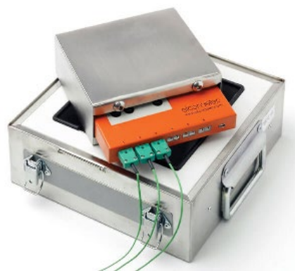
High Temperature Barrier Kit Thermal barrier & heat sinks for longer time at temperature