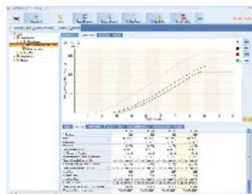
Statistical analysis by probe/channel