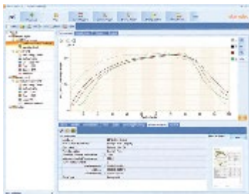
Standard temperature profile and cure Process graphs can be viewed at any time