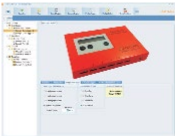
Create and store unique oven profile setups and transfer them to the gauge