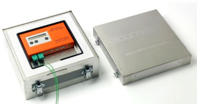
Standard Thermal Barrier Kit With thermal barrier - ideal for single runs