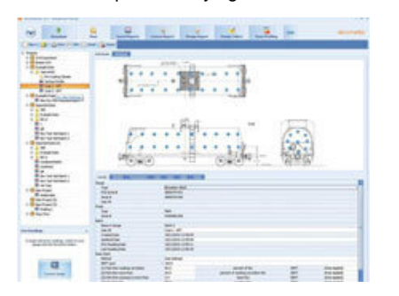
Using the Report Designer within ElcoMaster®, measurements can be quickly displayed on an image or drawing