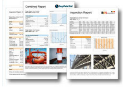
Generate .pdf reports combining all your inspection data and share via email or the cloud at the click of a button.